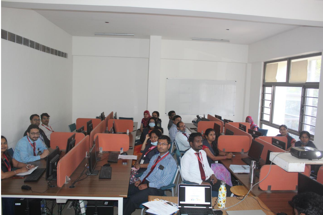
Faculties involving in the Coding Level challenge using LabVIEW.

architecture, Producer - Consumer Architecture, Coding pattern question discussions. Then on this day the faculties started solving many advanced coding level tasks and they were involved in coding questions.