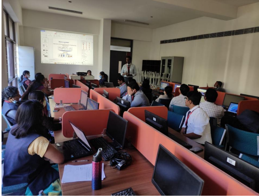
Discussion on Core I Programming concepts of LabVIEW