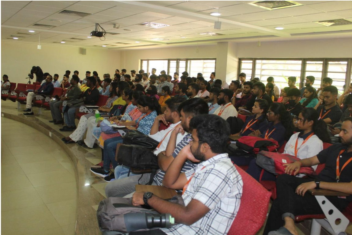
Students attentively listening to the lecture

At the end of the session, students posed queries to the Speaker for around half an hour.