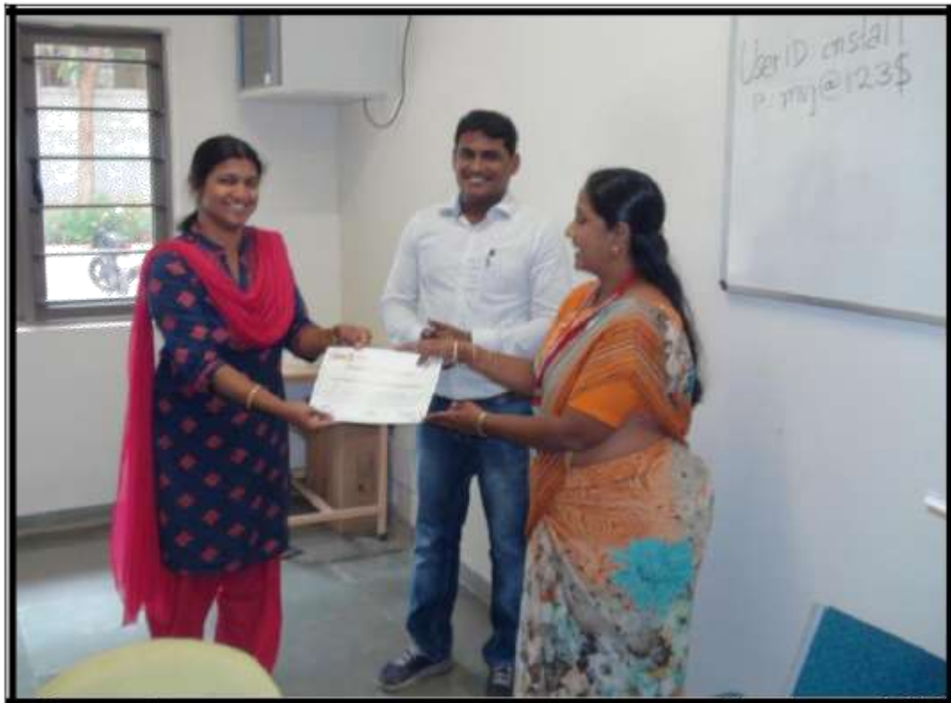
Distribution of Certificates to participants |