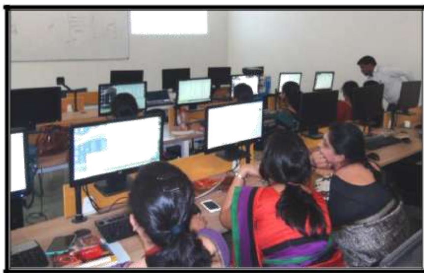
Day 3 : Participants coding the application in Java & J2EE |