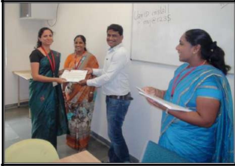
Certificate distribution to participants |