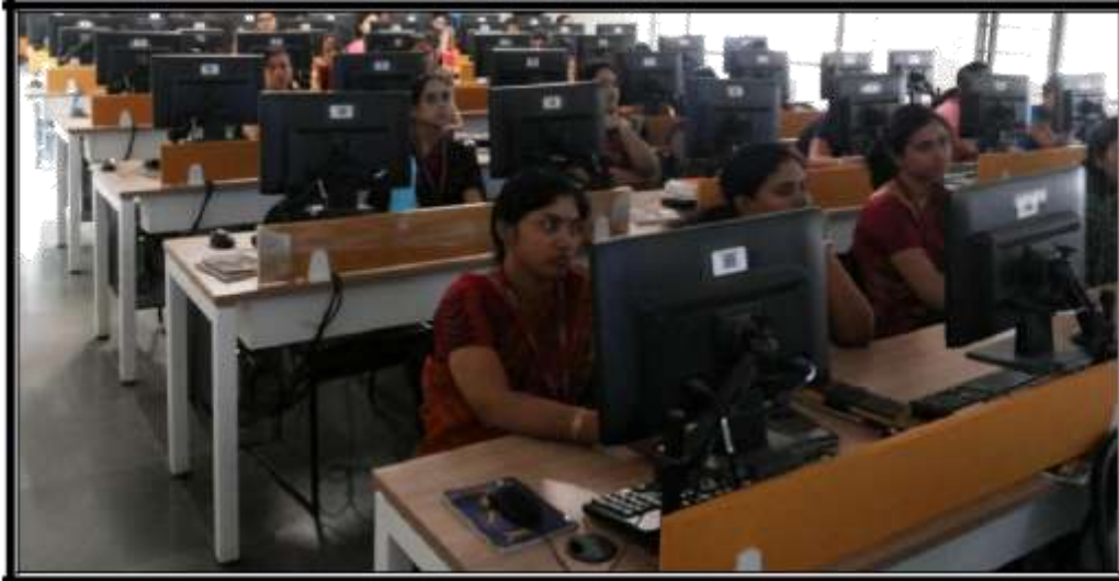
Day 1 : Participants in Lab for FDP on cloud computing |