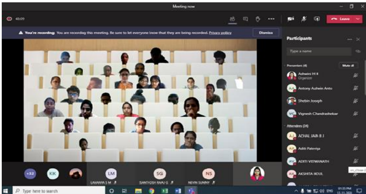
NIC Club Event "TECHFLAG" organized by CSE Department: Students who cleared Round 1 attended this Pre-Workshop held on MS Teams to understand the design process of Capture the Flag which is the final round event. The Pre-workshop was held on 15th November, 2020.