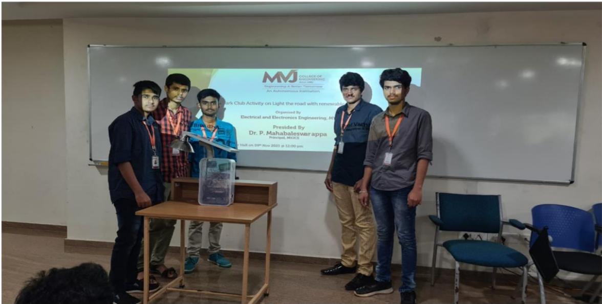
Spark club activity on "Light the Road with Renewable Energy" organized by the department of EEE, MVJCE on 9th November 2021: 1st Prize Winners