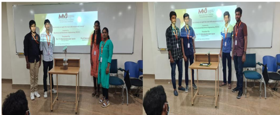
Spark club activity on "Light the Road with Renewable Energy" organized by the department of EEE, MVJCE on 9th November 2021: 2nd Prize Winners