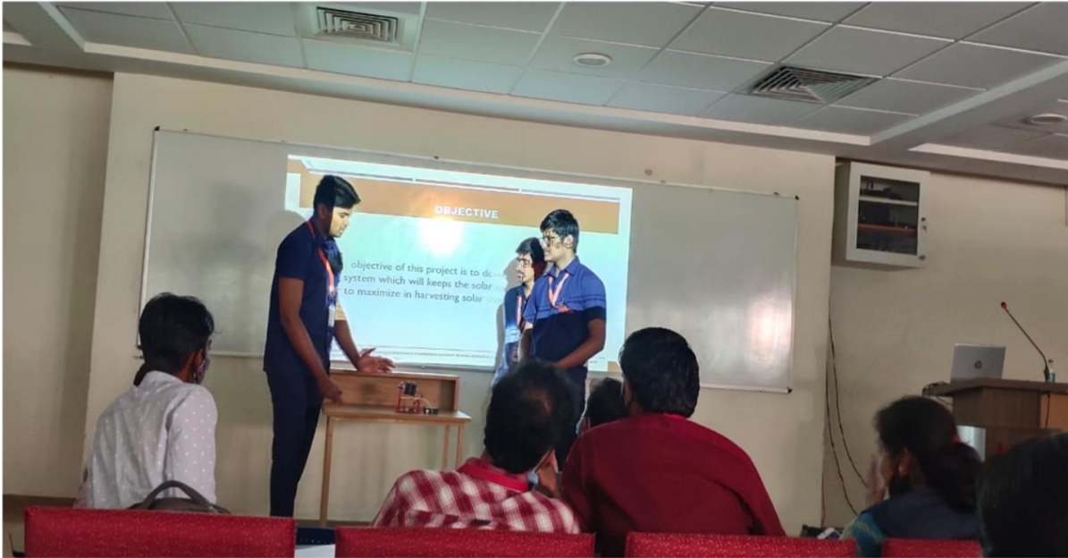
Spark club activity on "Light the Road with Renewable Energy" organized by the department of EEE, MVJCE on 9th November 2021: Participants demonstrating their models